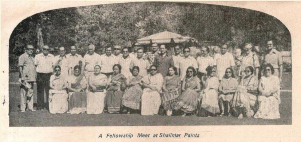
A Fellowship Meet at Shalimar Paints